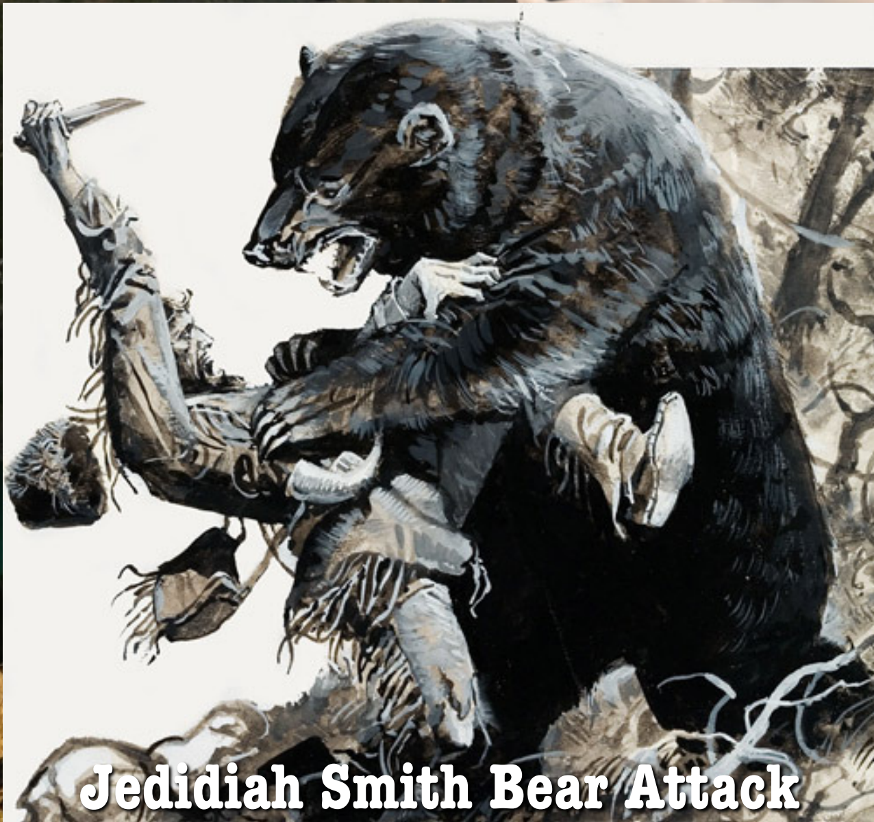
Jedidiah Smith Bear Attack

“I have worked harder, been put in prison more often, been whipped times without number, and faced death again and again. Five different times the Jewish leaders gave me thirty-nine lashes. Three times I was beaten with rods. Once I was stoned.”