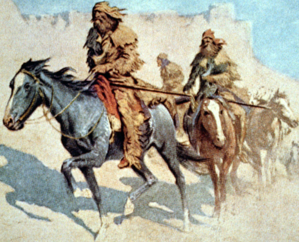
Jedidiah Smith Crosses Mojave

“I have worked hard and long, enduring many sleepless nights. I have been hungry and thirsty and have often gone without food. I have shivered in the cold, without enough clothing to keep me warm. Then, besides all this, I have the daily burden of my concern for all the churches. Who is weak without my feeling that weakness? Who is led astray, and I do not burn with anger?”